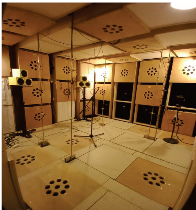
Figure 1. Picture of the room for broadcast of infrasonic frequencies. The room is equipped with 32 subwoofers speakers ( f \leq 40 Hz), 40 low frequency speakers ( 40 < f \leq 3000 Hz) and 6 medium frequency speakers ( 3000 < f \leq 17000 Hz).

would alter measured threshold. Indeed, as shown by Møller & Pedersen [2], hearing thresholds increase very quickly with decreasing frequency below 20 Hz, as such, harmonic distortion occurring at higher frequency that the one tested will have a much lower hearing threshold and thus might be heard instead of the frequency of interest. To broadcast infrasonic frequencies the room is equipped with 32 subwoofer speakers on opposite wall (see Fig. 1) that allows to reach the needed levels to make these frequencies audible. The room is able to reach significant level with minimal distortions (i.e. distortions levels must be lower than their associated hearing thresholds) as shown in Fig. 2. A more thorough description of the room is proposed by Pachebat et al [6] (in French).