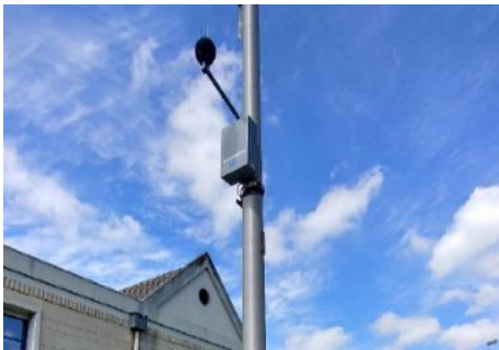
Figure 2. Temporary noise measurement system (Classic sound level meter)

In order to assess the railway noise exposure of the participants, about 15 noise measurement systems were installed in the environment simultaneously with the survey: 14 classical stand-alone sonometer boxes placed all over the study area and an expert system (medusa), placed in the centre of the study area, developed by Bruitparif and having an automatic detection functionality of the direction of sound origin. This functionality allows the detection of sound events coming from a specific area. It will thus be possible to detect all rail traffic in an exhaustive manner. These measurement systems will provide Leq,100 milliseconds noise levels for the overall A and C weighted levels.