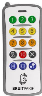
Figure 4. Electronic device for rating instantaneous annoyance when a train passes.

One of the central components of the survey is to provide participants with an electronic device for rating the instantaneous annoyance of passing trains. This device takes the form of an electronic box the size of a remote control. The device allows participants to assign a score of annoyance (from 1 to 10) due to the noise of a particular passing train. Each participant will have to carry out a total of three hours of train scoring in 6 sessions of 30 minutes or 3 sessions of one hour. These sessions will be carried out during preferential time slots determined in consultation with the Bruitparif interviewers and according to the participant's lifestyle. The sessions will be dedicated only to the rating of trains and not to other activities, so that the annoyance rating is not influenced by the type of activity. The participant will be able to specify the scoring conditions: inside the home with the windows closed or open or outside the home. This electronic scoring device will allow each train passage to be precisely time-stamped with the corresponding annoyance score. These annoyance ratings can then be associated with the acoustic characteristics of railway events measured in the environment.