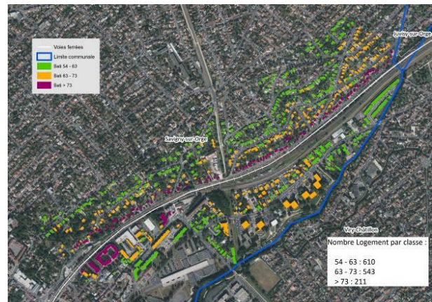
Figure 1. View of the pilot site

The selected pilot site meets all these criteria and is located in the commune of Savigny-sur-Orge in the south of the Île de France region. The selected area includes more than 1300 dwellings. It offers a sufficient potential number of dwellings to recruit about 60 participants.