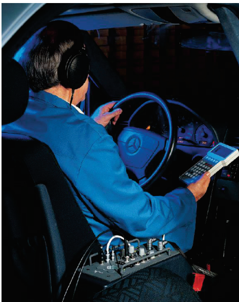
Figure 4. First acoustical driving simulator with vibration at seat and steering and interactively sound simulation based on transfer-path-analysis [7]

The next evolutionary step lies in predicting how modifications to transmission paths will affect perceptible acoustics. In 1992, as part of a European-funded research project AQUESTA [5], binaural transfer path analysis and synthesis (Pro(g)noise) was developed in order to be able to interactively auralize changes in airborne sound transmission paths and/or altered impedances and stiffnesses binaurally. As early as 1996, the first sound car was introduced, which could simulate not only binaural signals, but also the vibrations perceptible in the seat and steering [6].