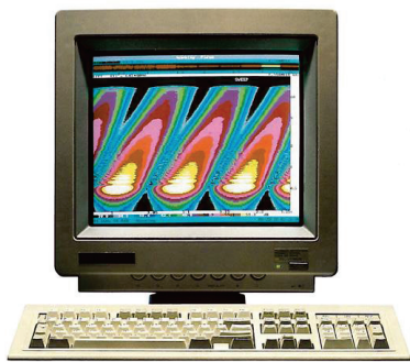
Figure 2. PC-system with DSP-board to analyze sound like the human hearing combined with interactively manipulation of sound and psychoacoustic analysis [2]

Very quickly, the advantages of a faithful reproduction of sound events became apparent during the application of binaural measurement technology: a direct comparison of different driving situations or of different vehicles or modifications was now very quickly possible even for inexperienced persons. Measures taken could be impressively demonstrated to the management without resorting to diagrams and measurement data evaluations that are difficult to understand.