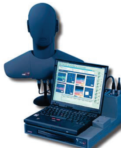
Figure 3. Mobile portable multi-channel recording system to record not only the sound but nearfield microphones and accelerometer signals, too, including information about speed and rotation

This combination of hardware artificial head recording and calibrated, equalized headphone playback system, DSP boards and software led to the founding of HEAD acoustics GmbH in 1986, which further developed this innovative approach to noise assessment and design worldwide and made it available to a wide range of applications. The practical applications led to consistent further developments: if it was now possible to quickly find out which signal components in the noise are responsible for annoyance and quality, the desire arose to recognize their sources and transmission paths in airborne as well as structure-borne sound. This led to the expansion of the previously two-channel measurement technology for binaural signals to a multi-channel measurement technology (SQLab) in order to record sources and transmission paths with microphones in the near field and with acceleration sensors at the force application points. In addition, other variables such as speed and engine speed were recorded [4].