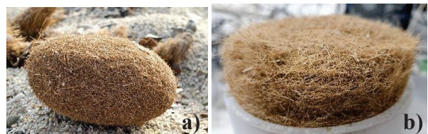
Figure 1. Aegagropiles (a) and Poseidonia Oceanica fibers (b)

This research aims to explore the possible acoustic application of loose fibers obtained with a manual process from Posidonia Balls (Figure 1b); experimental tests were conducted by compacting the fibers with different densities, in order to obtain an analytical model capable of calculating the sound absorption coefficient of this material for any combination of thickness and density.